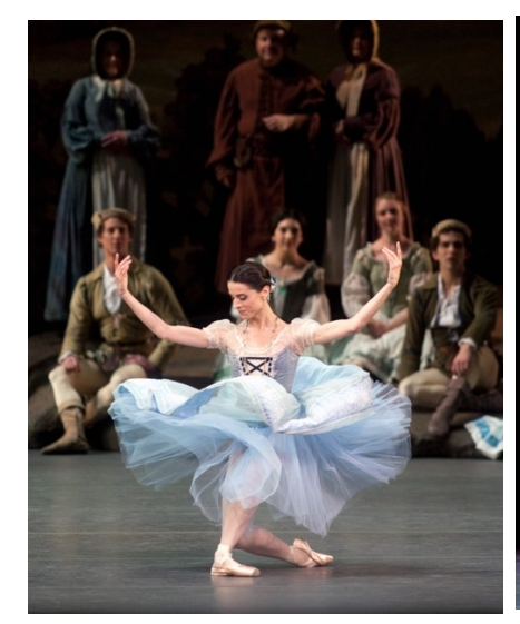
Plier to bend