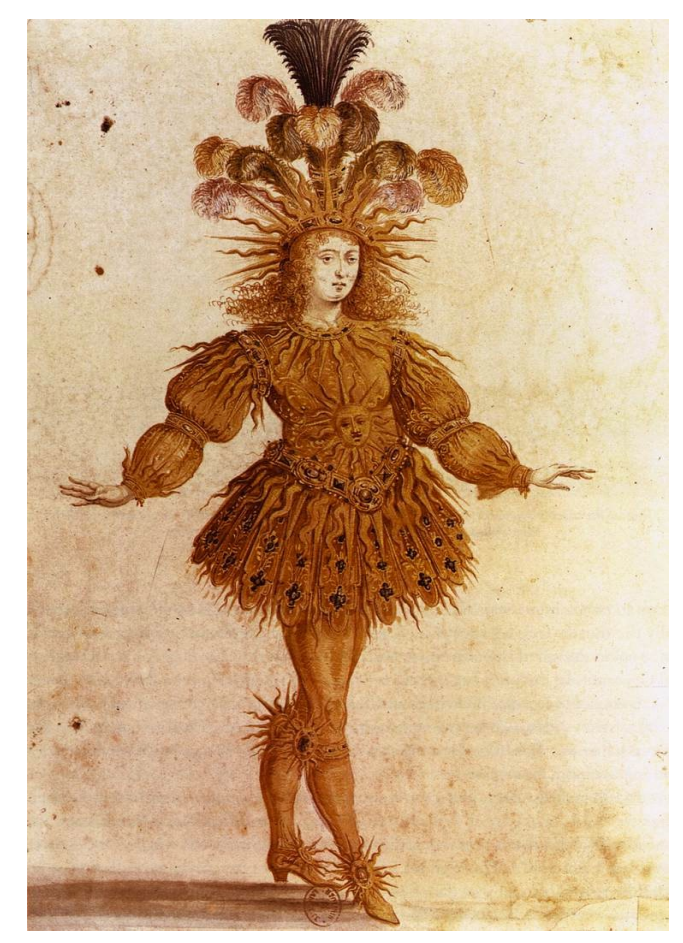
Louis XIV in Ballet de la Nuit (1653)

Evolving from an amateur pastime, ballet moved from the court to stages in order to showcase and present dance to a wider audience. The art form experienced tremendous growth under King Louis XIV, and the first official ballet academy was established in 1661. Today, the school is known as The Paris Opera Ballet and still exists today as the oldest ballet school in the world. This was part of King Louis' effort to improve and refine the level of dance instruction. Even though the word ballet comes from the Latin word "ballare," which means to dance, the language of ballet is French, as many of the terms and steps were created by the king, his court, and the first ballet teachers.