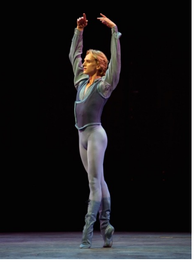
Relever to rise or raise