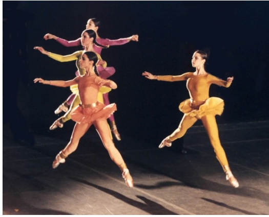
Glisser to glide or slide