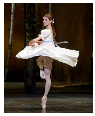
Tourner to turn