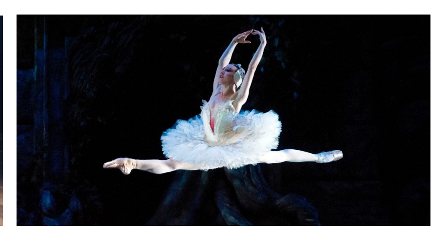
Sauter to jump