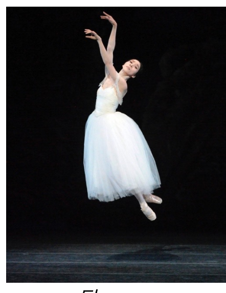
Elancer to dart