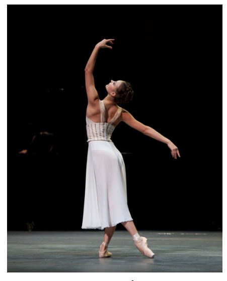
Etendre to extend or stretch